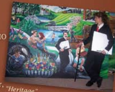
"Heritage" by Sherry Pettey